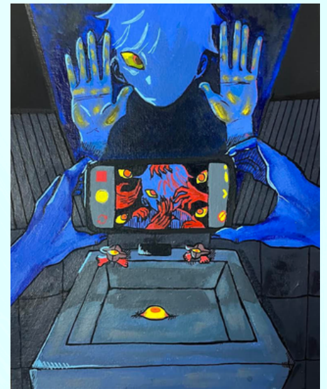
Student Artwork Samples